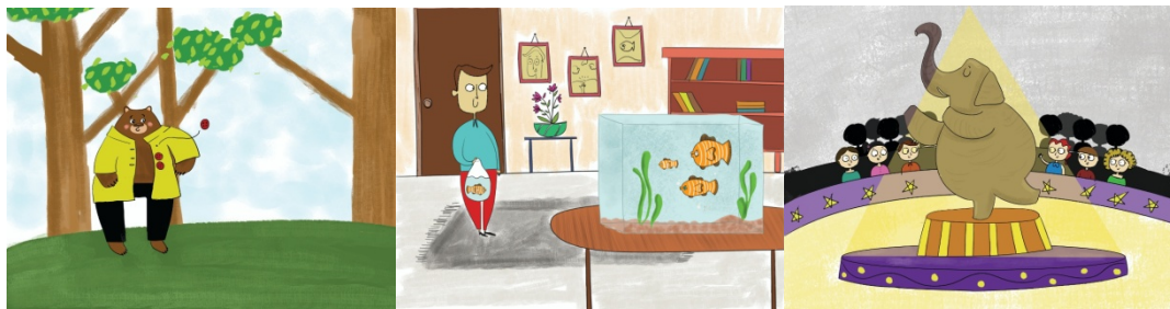
FIGURE 2. Some drawings for the CTTC

As children could not remember the stories, sample drawings not indicating the answers directly but reminding of the story process were made (to be used while story reading and answering of the questions by children) for each story, so that children would not make mistakes. A graphic designer drew the drawings. As a result of the study, 3 drawings were prepared for the first story (regarding the interpretation, explanation and evaluation subscales); 3 drawings for the second story (regarding the inference and analysis subscales) and one drawing for each of the third, fourth, fifth and sixth stories (regarding the self-regulation subscale) (Figure 2). The drawings were prepared in the digital media. While performing the drawings, their colorful printouts were taken and they were reinforced with PVC. A preliminary study was conducted with 10 children, in order to examine whether the stories and questions were comprehensible or not. During the preliminary study, comprehensibility of the stories and questions for children was examined, unclear statements were corrected and expressions in the sentences were simplified. Throughout the application, all the answers given by children to the questions in the CTTC were recorded. The answers recorded were later used in the score coding of the test.