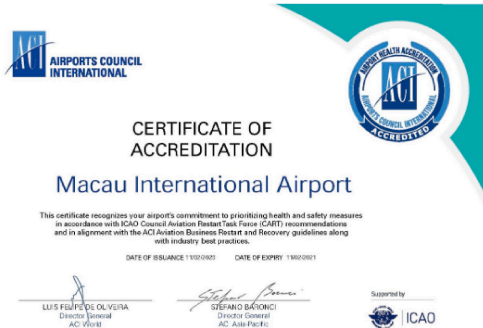
Fig. 3. Certificate example. 11